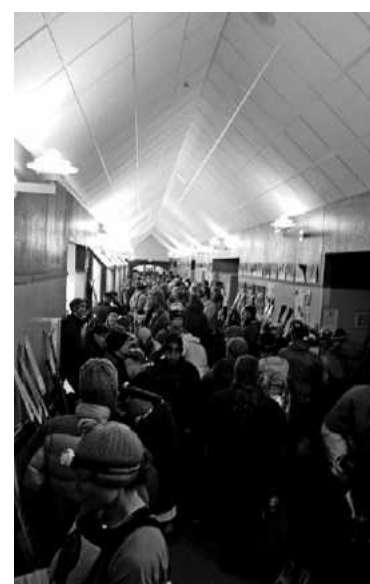
The madness of final check in, a few minutes till midnight.