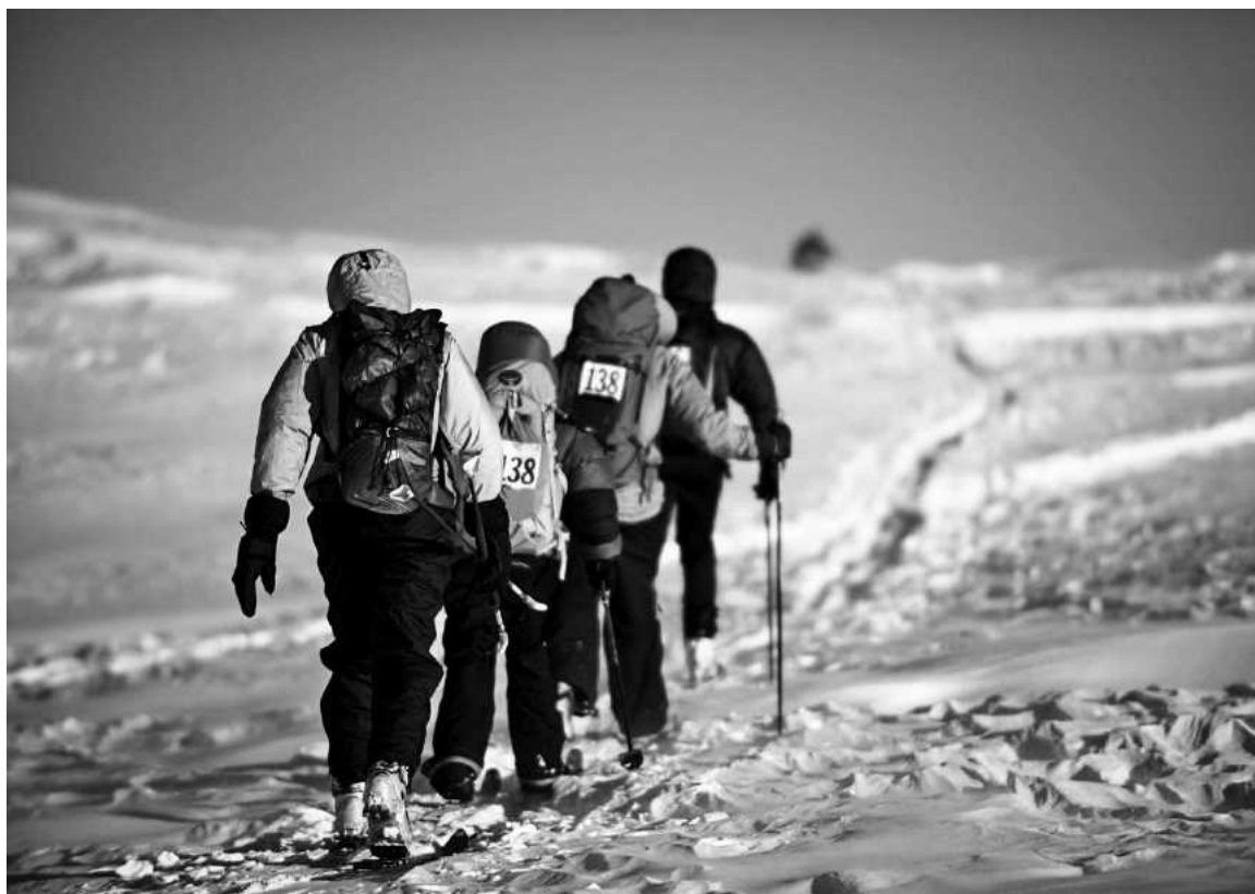
The wind-swept scene from near Taylor Pass.